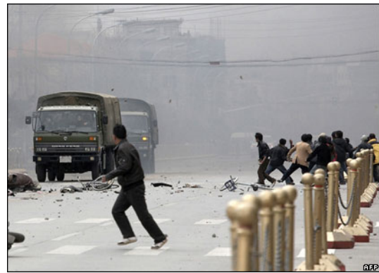
[Protesters in Tibet]

the Chinese and international media in the months leading up to the Beijing Olympics. The complexity of the issues involved, Beijing's decision to saturate state media with government bias in denial of this complexity, and the government's lack of openness with the media caused some western reports to be based on misinformation rather than evidence and served to compound the damage to China's international reputation.