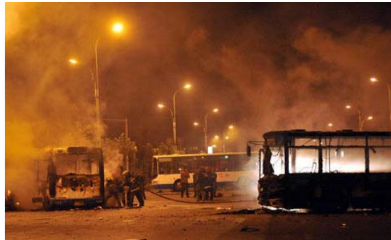
[Buses burned by protesters]