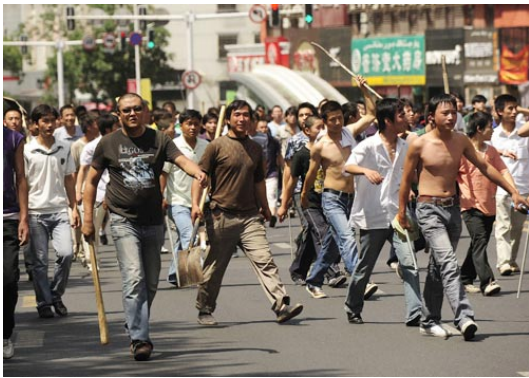
[Han Chinese protesting in Urumqi]

and a curfew was imposed. However, there was still an atmosphere of anxiety, fear and anger amongst the population. Some of this was directed towards the government and its handling of the recent events. In the aftermath of the riots, crowds demanded the resignation of Wang Lequan, the CCP party secretary in Xinjiang. Wang Lequan has since kept his job, but the Urumqi party secretary was fired, as was the provincial police chief. 21